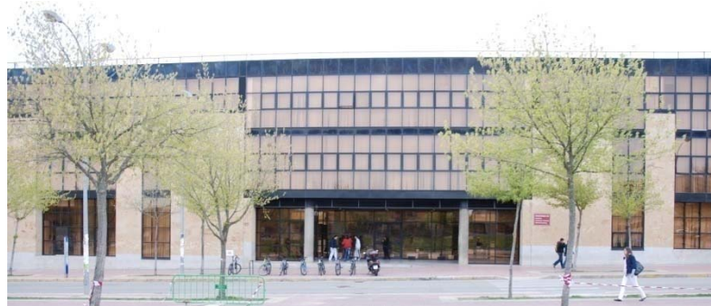
'F.E.S.' Lecture Room Building