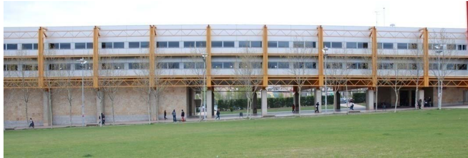
'Francisco de Vitoria' Library